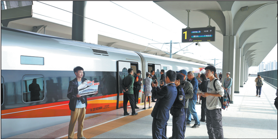
Passenger takes a picture in front of a high-speed train before it leaves for Guangzhou at Zhanjiang North Railway Station on Monday.