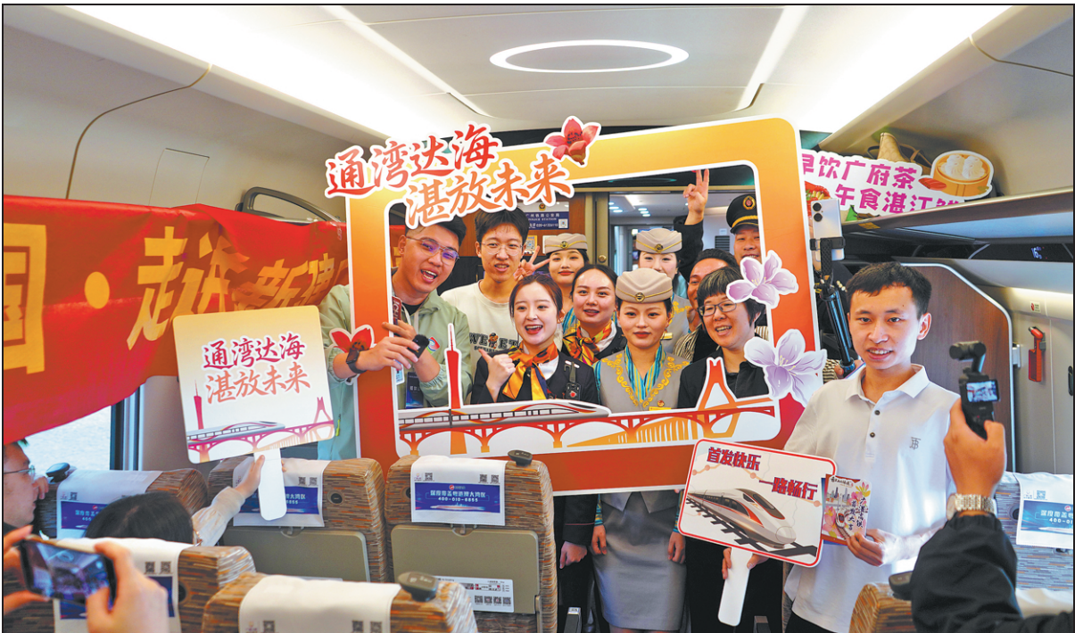
Passengers and train attendants pose for a photo at the first train service of the Guangzhou-Zhanjiang High-Speed Railway on Monday.