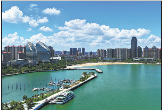
The Jinsha Bay is a popular tourist destination in Zhanjiang.